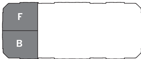
Unit 1 - B, F

Actual usable floor space may vary from stated floor area. E. & O. E. Plans and specifications are subject to change without notice. March 2016.