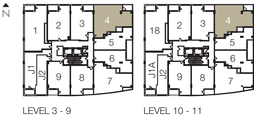
LEVEL 3 - 9